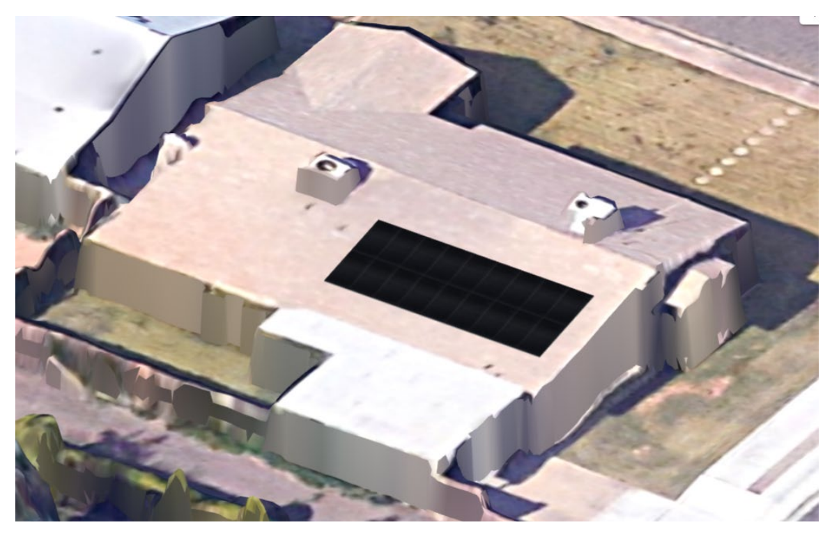
Figure 3-1: 3D model of the SW System created by PVEL in the Application.